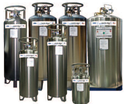
Carbo Series Bulk CO 2 Systems

Maximize Your Beverage Profits - It works like this: