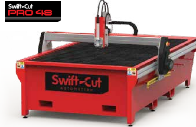
PRO 48 Cutting area 4' x 8' (1250mm x 2500mm)