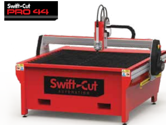
PRO 44 Cutting area 4' x 4' (1250mm x 1250mm)

The Swift-Cut Pro Series - a collection of three cutting edge design CNC plasma cutting tables. With easy to use software, the Swift-Cut Pro series promises high speed precision cutting at a low cost investment. Easy to use, simple to learn and operate with exceptional service and support, the Swift-Cut Pro Series is the answer to affordable metal cutting.