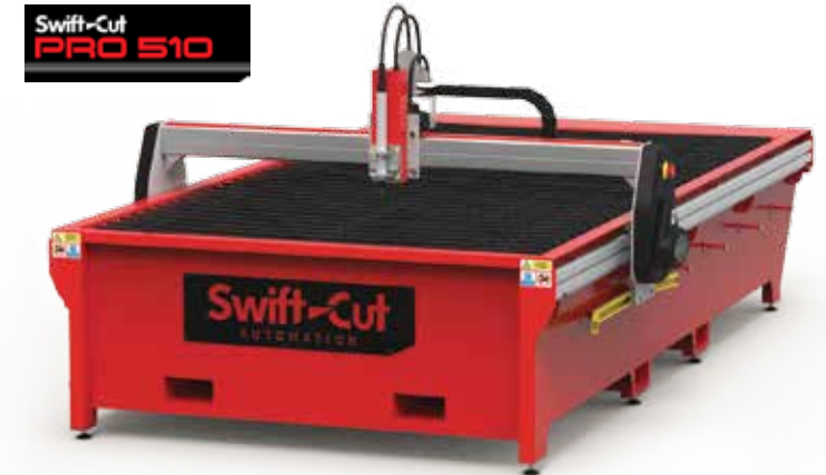
PRO 510 Cutting area 5' x 10' (1500mm x 3000mm)